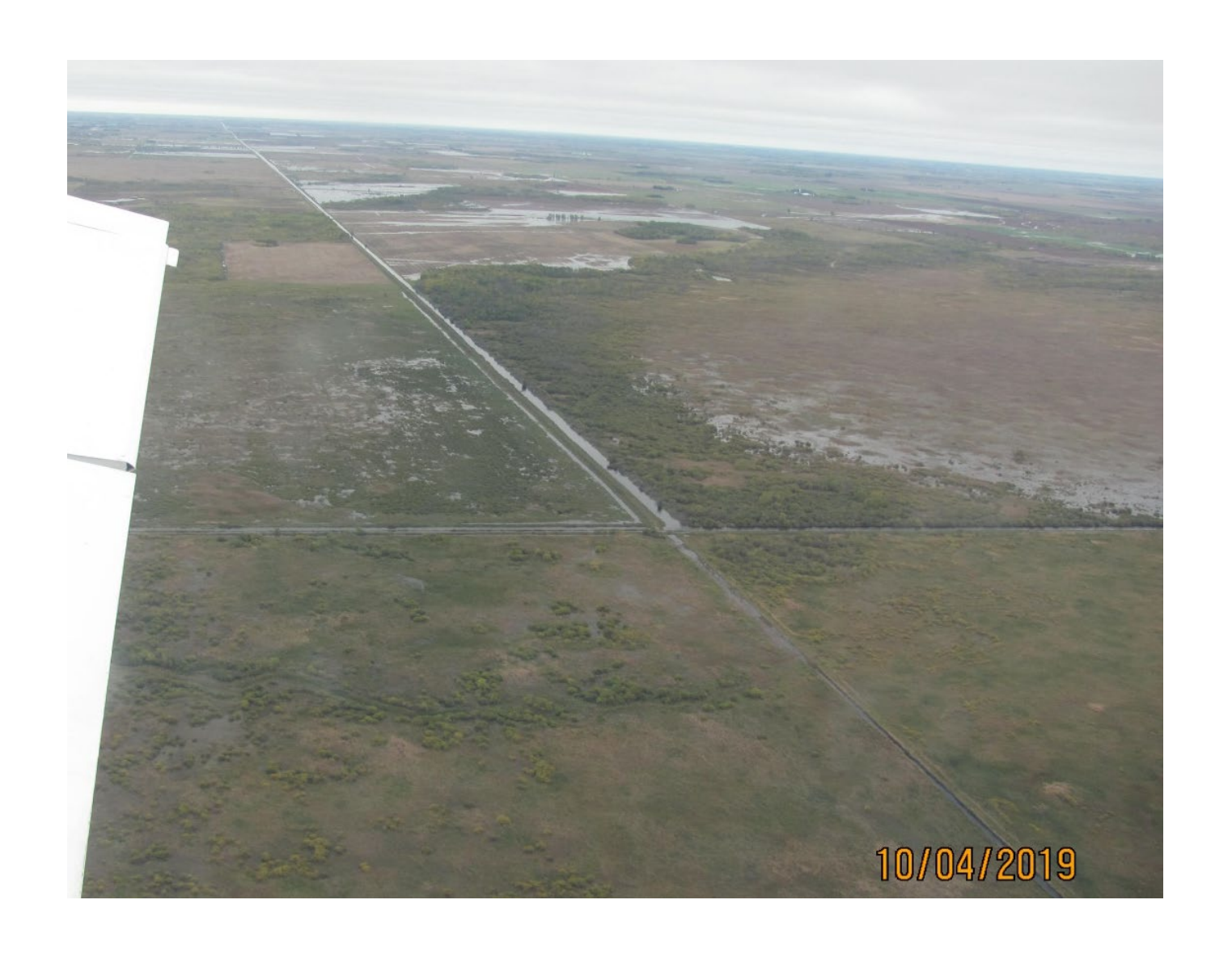
Lat1 SD95 - Looking East Kittson Co. foreground & Roseau Co. Background - Peatland Twp section 36 in lower left